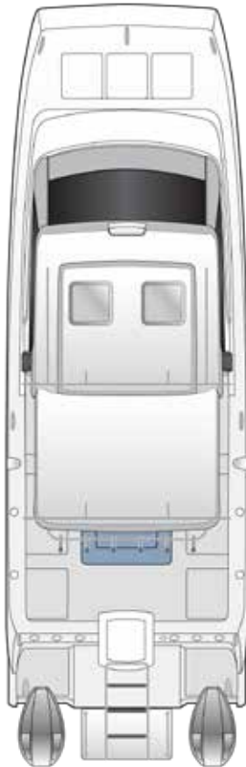
OPTION MAIN DECK W/ TOP AND CANOPY