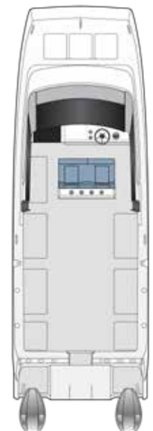
STANDARD MAIN DECK

All specifications and options are subject to change by Sino Eagle Yachts at their sole discretion. Performance is purely indicative and not a contractual commitment. Performance is subject to many variances outside the control of Sino Eagle Yachts. Specifications and graphics in this brochure are non binding and customer must enter into contractual agreement with the Dealer or Agent of Record.