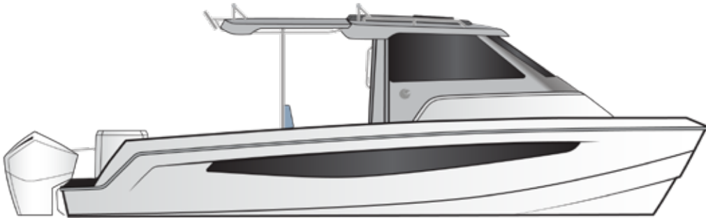
EXTENDED SUN CANOPY

*More options available than shown. For a full listing please review with sales consultant.