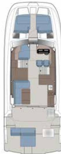
MAIN DECK (Inboard Engines)