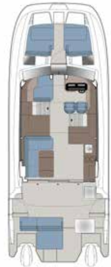
MAIN DECK (Outboard Engines)

All specifications and options are subject to change by Sino Eagle Yachts at their sole discretion. Performance is purely indicative and not a contractual commitment. Performance is subject to many variances outside the control of Sino Eagle Yachts. Specifications and graphics in this brochure are non-binding and customer must enter into contractual agreement with the Dealer or Agent of Record.